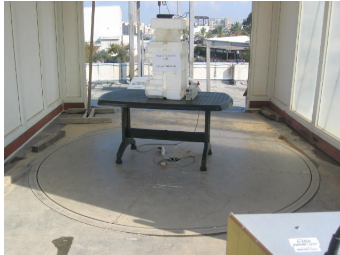
Figure 3 Spurious Emission Test